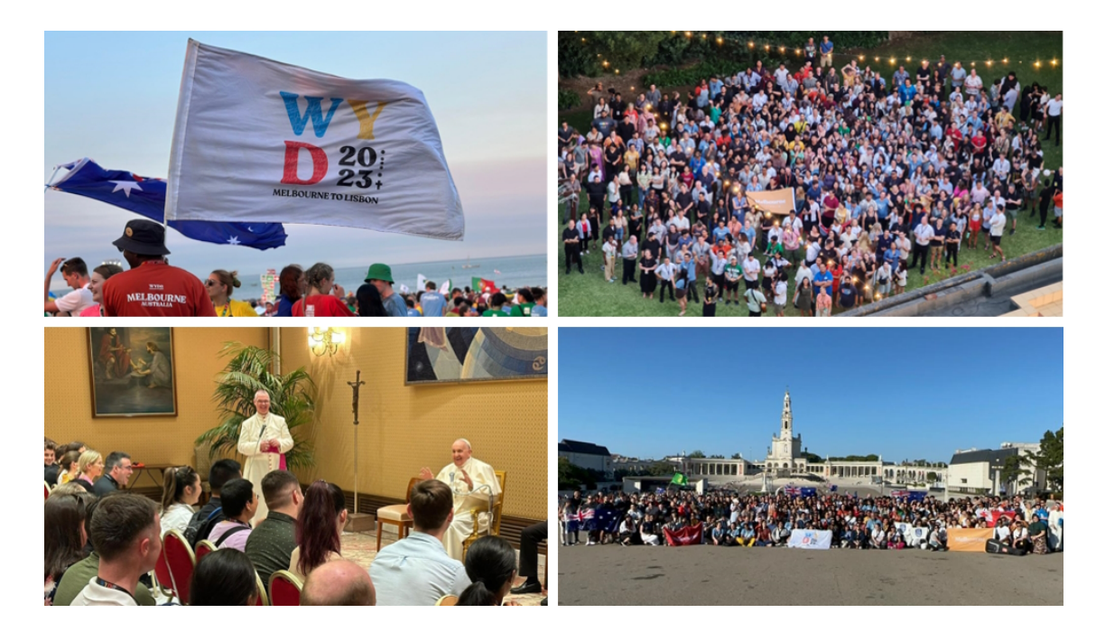
600 Melbourne World Youth Day pilgrims are now settling back into life across our

Welcome to Proclaim, a regular newsletter to help keep parish leadership teams informed and inspired as they proclaim and live out the joy of the Gospel.