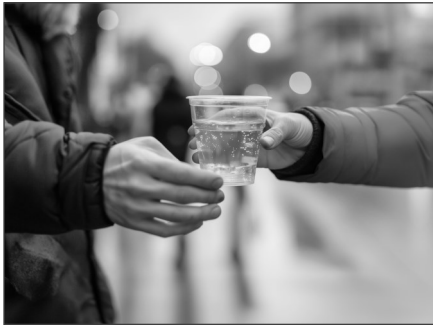
The Gospel of the Lord.

'If anyone gives you a cup of water to drink just because you belong to Christ, then I tell you solemnly, he will most certainly not lose his reward. 'But anyone who is an obstacle to bring down one of these little ones who have faith, would be better thrown into the sea with a great millstone round his neck. And if your hand should cause you to sin, cut it off; it is better for you to enter into life crippled, than to have two hands and go to hell, into the fire that cannot be put out. And if your foot should cause you to sin, cut it off; it is better for you to enter into life lame, than to have two feet and be thrown into hell. And if your eye should cause you to sin, tear it out; it is better for you to enter into the kingdom of God with one eye, than to have two eyes and be thrown into hell where their worm does not die nor their fire go out.'