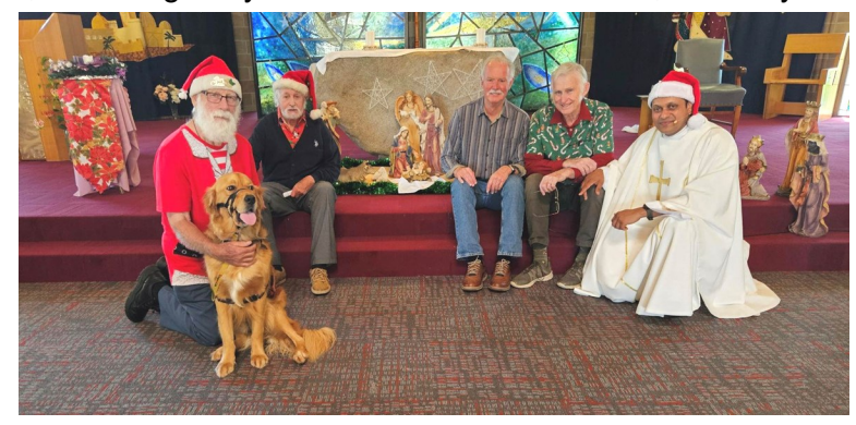
Coffin Dodgers always making our celebrations more festive